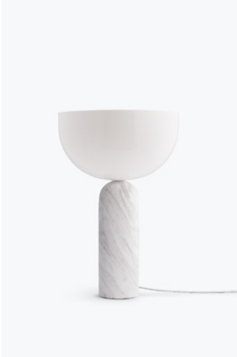
White Marble w. White Acrylic