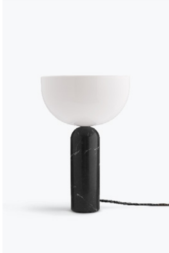
Black Marble w. White Acrylic